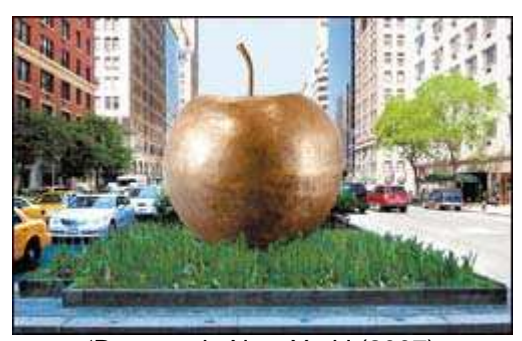
'Pomme de New York' (2007) by Les Lalanne in Manhattan